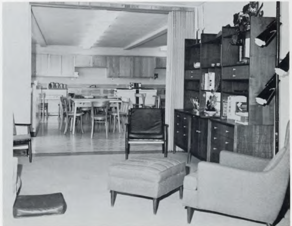
View of our new Home Economics department where the Future Nurses Club meets.

The Nurses Club, a new one to our school, began their first year by holding a candy sale. Their profits were used to make gifts for the children at Maybury. They also helped supply the school clinic. On March 1, they invited an instructor and a student nurse to speak about nursing careers. The rest of the year was filled with trips to different hospitals.