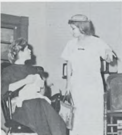
The town gossip