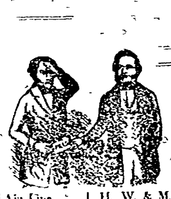
Air Line. H. W. & M.

Sick, I are you Air Line? Well, here are those "bitter Pills" that were pronounced you