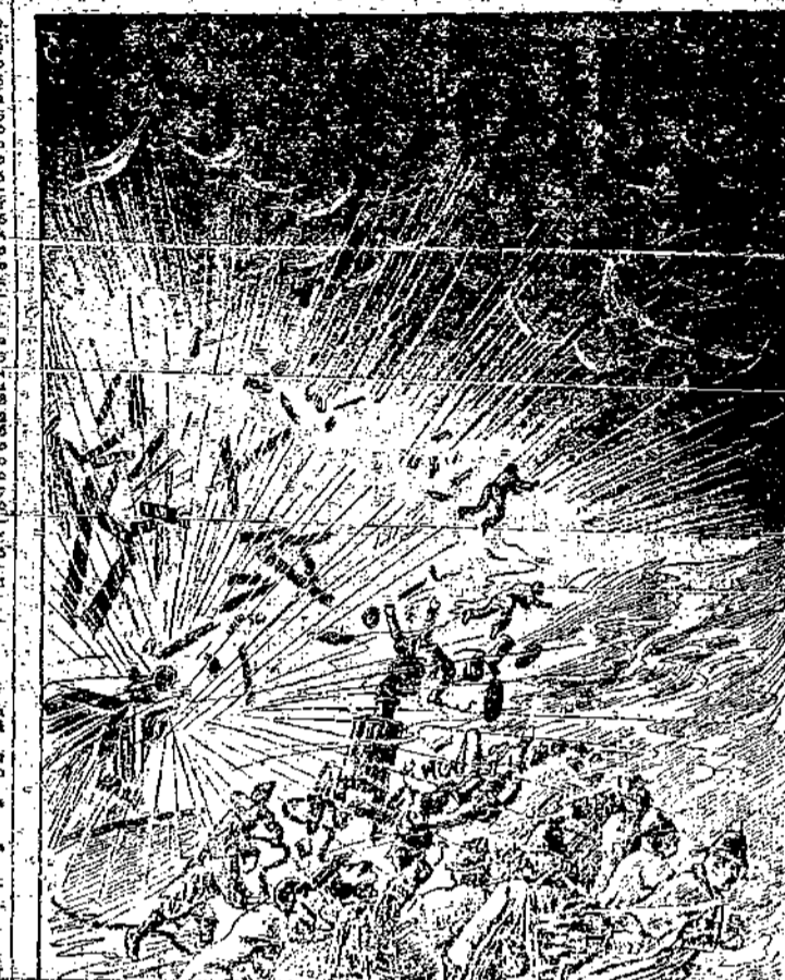
WERE FOLLOWING THE POWDER EXPLOSION AT BUTTE CITY, MONT.