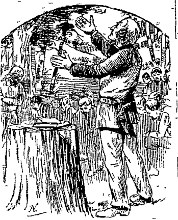
PRAYING FOR HIS ENEMIES

I imagine that he's young and handsome, said the captain. What till you see him, the guide remarked.