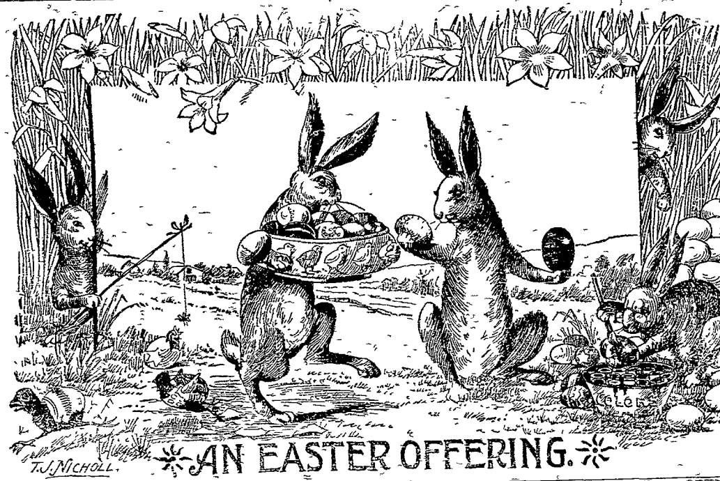
AN EASTER OFFERING.