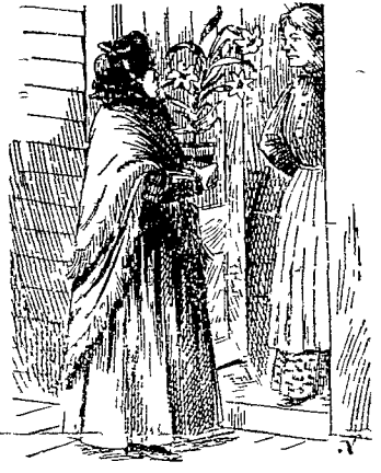
"FOR THE CHILD."

THE wide windows of the two tenement buildings faced across a narrow yard and old Mrs. Dewey's flowers were a wonder to the residents of number 1319.