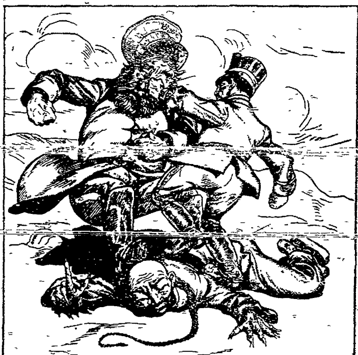
China: "I wish the world to understand that I am neutral in this affair."

nomination and to escort him before the convention.