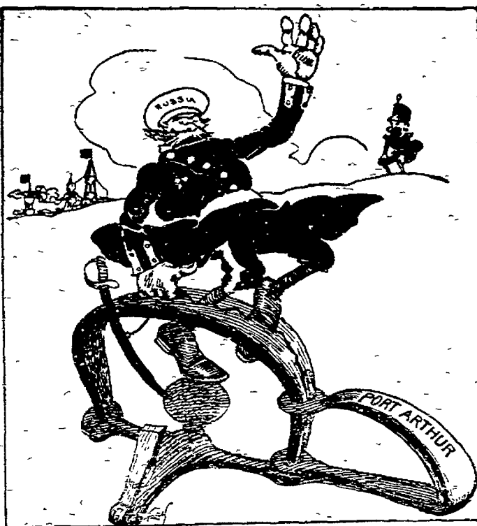
CAUGHT IN HIS OWN TRAP.