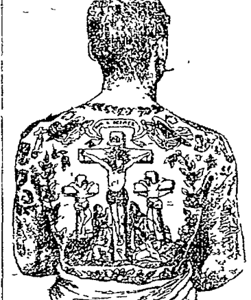
Tattooed by Hand.