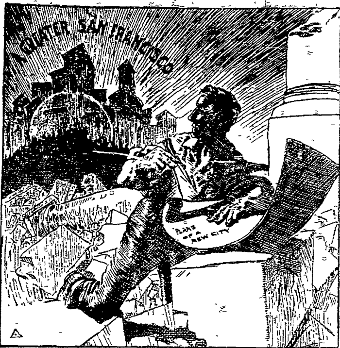
—Philadelphia North American.