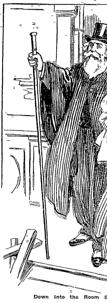
Down into the Room Stepped My Grandfather.

little work for the church militant! And this gentleman?—he indicated Larry, who was, for once in his life, without anything to say.