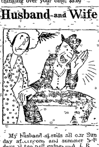
My husband spends all our Sun day afternoons and summer days at face ball games.—A. L. R.