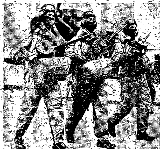
Bound for an observation flight over enemy territory, these three British musketeers of the air head for their bombing plane.