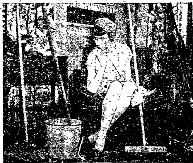
Spring may mean flowers, buds, birds, or fishing, swimming, or playing games to some, but to this housewife, it just means house cleaning.

To some March 21 means that spring house cleaning is near. To others it means sailing boats, playing marbles, circuses, fishing or baseball.