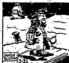
Cadillac went to France and asked for troops at Detroit, despite recent decree.