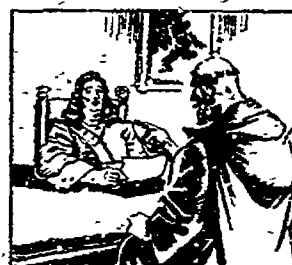
Fearing Cadillac at Detroit would speed Indian ruin, Jesuits opposed him.