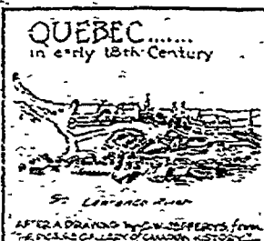
In 1696 Upper Lakes posts were evacuated; Cadillac went to Quebec.