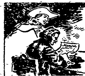
In his plan for a colony in the west, Cadillac's vision followed La Salle's.