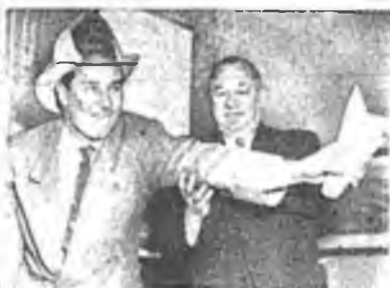
FIGHTER YANKEE Left handed - still getting his of the New York Yankees. Joe Page, major league baseball player, is seen here with a model of a new airplane. He is shown here with a model of a new airplane. He is shown here with a model of a new airplane.