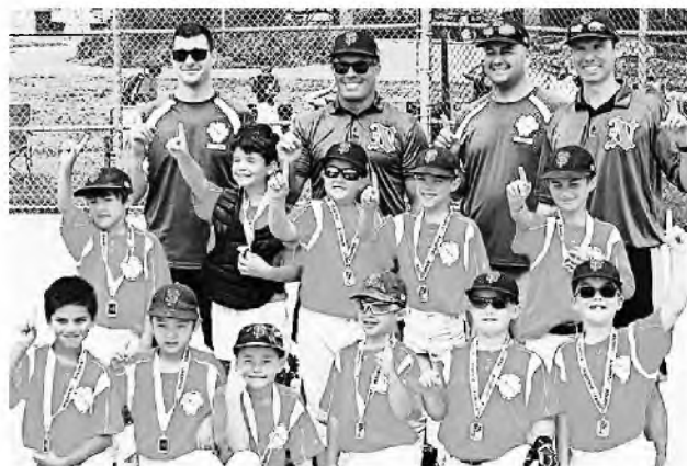
The Novi Youth Baseball League Pinto Division champion Giants.