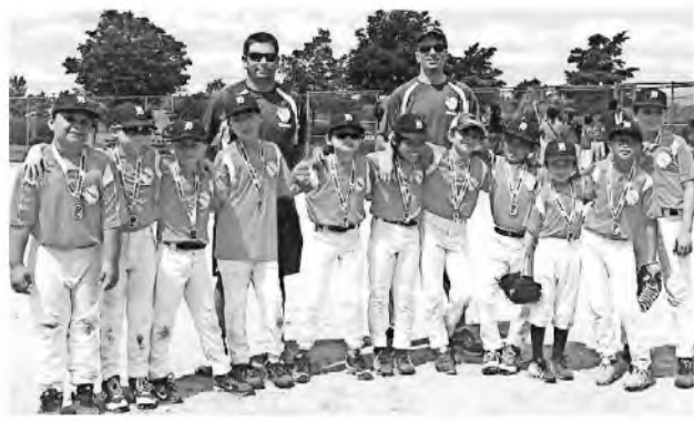
The Novi Youth Baseball League Tigers earned the Mustang Division crown.