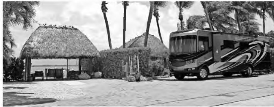
Bluewater Key RV resort near Key West features luxury tiki huts featuring flat-screen TVs and Wi-Fi.

cooking out, sharing Jet Ski rides and fishing from their docks.