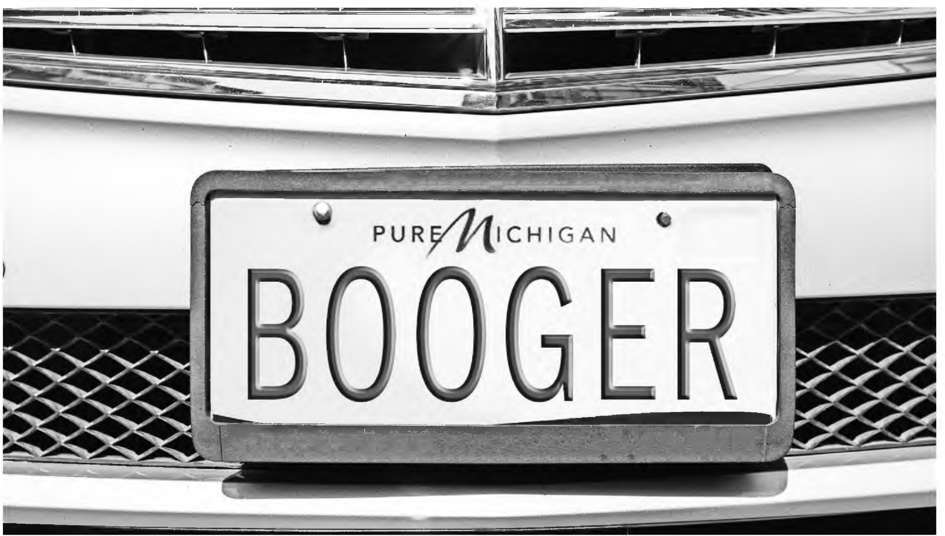
ILLUSTRATION BY DAN ALEGRIA

The new pacemaker (right) is small enough to be delivered through a catheter and implanted directly into the heart.