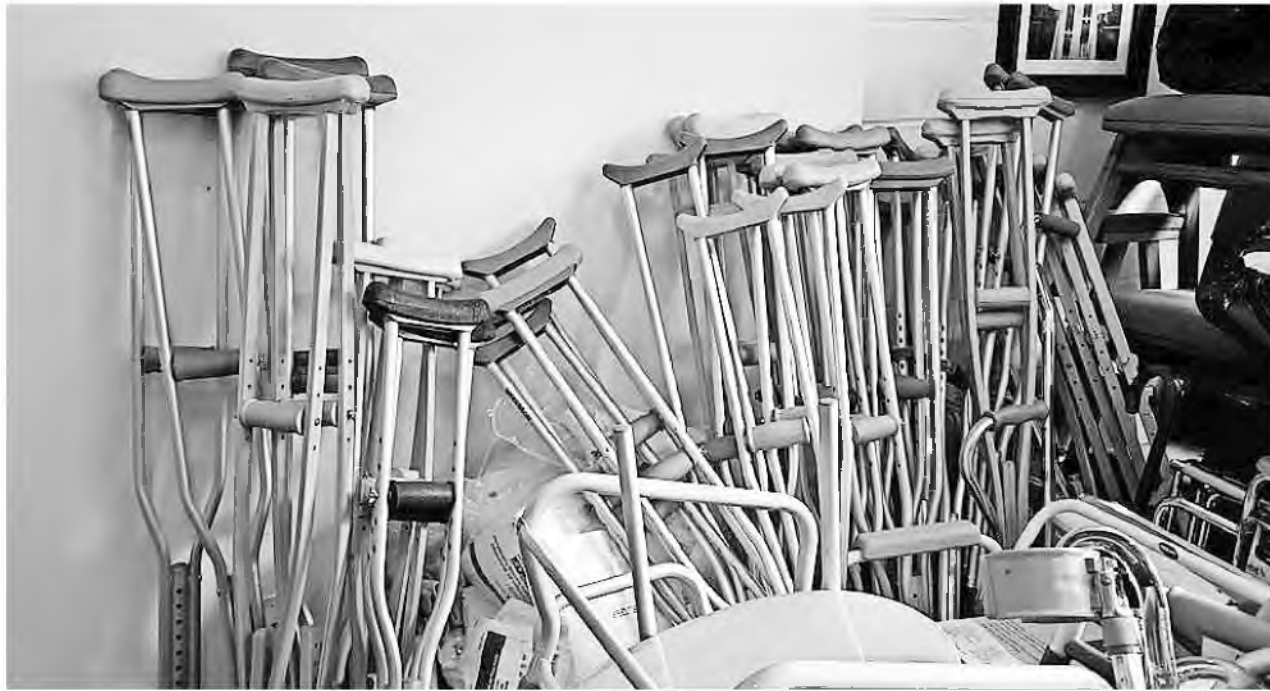
St. George's Episcopal Church in Milford is sponsoring a medical equipment drive through Aug. 15.

The Northville Summer Friday Night Concert Series - presented by Tom Holzer Ford - brings the music of some of the finest local musicians to downtown Northville's outdoor stage in Town Square