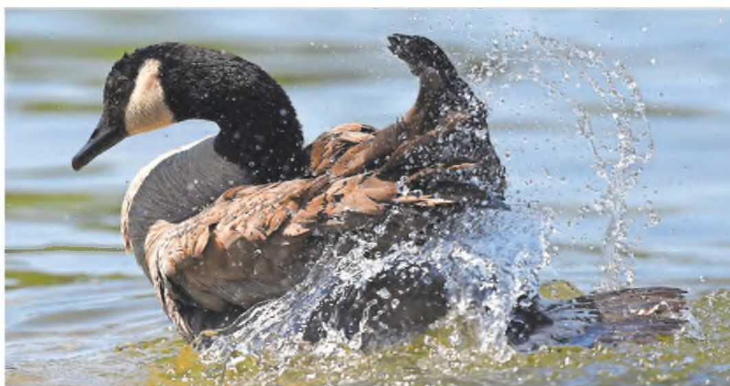
A Canada goose flaps its wings about in Walled Lake as it gives itself and bath. Many geese were in the waters of the lake just off Pavilion Shore Park bathing and preening their feathers as they prep for the fall flying season.