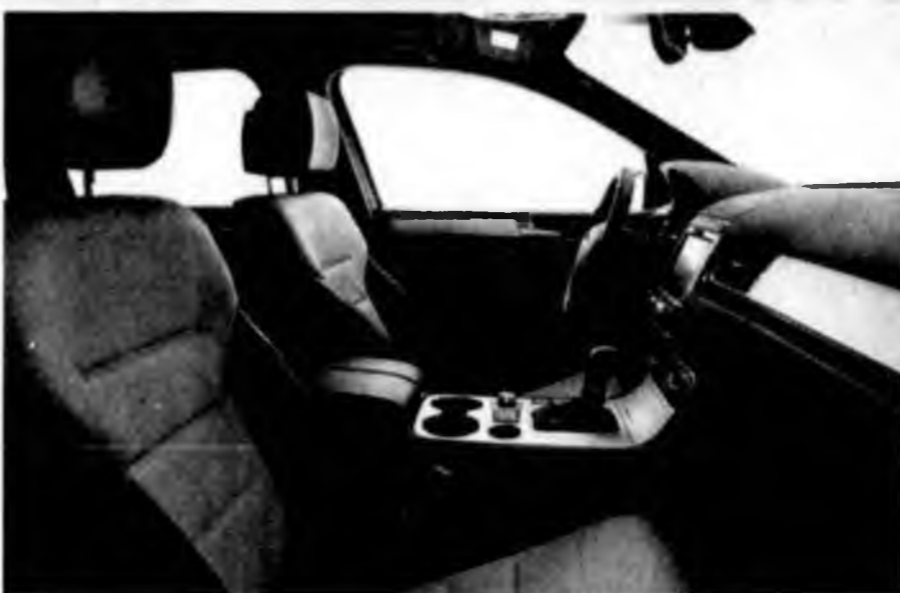
Inside, Touareg's restrained design is classy.

Inside, Touareg is restrained in a classy way as well. The cabin design is pretty conservative, but it evokes the premiumness that VW is after in this segment. Standard features