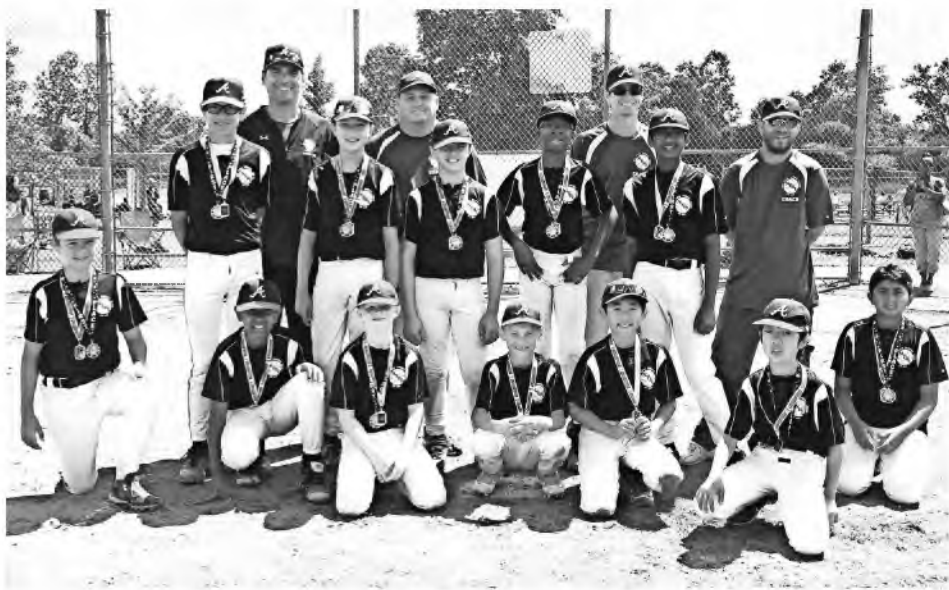
The Braves captured the Novi Youth Baseball League Bronco Division title.