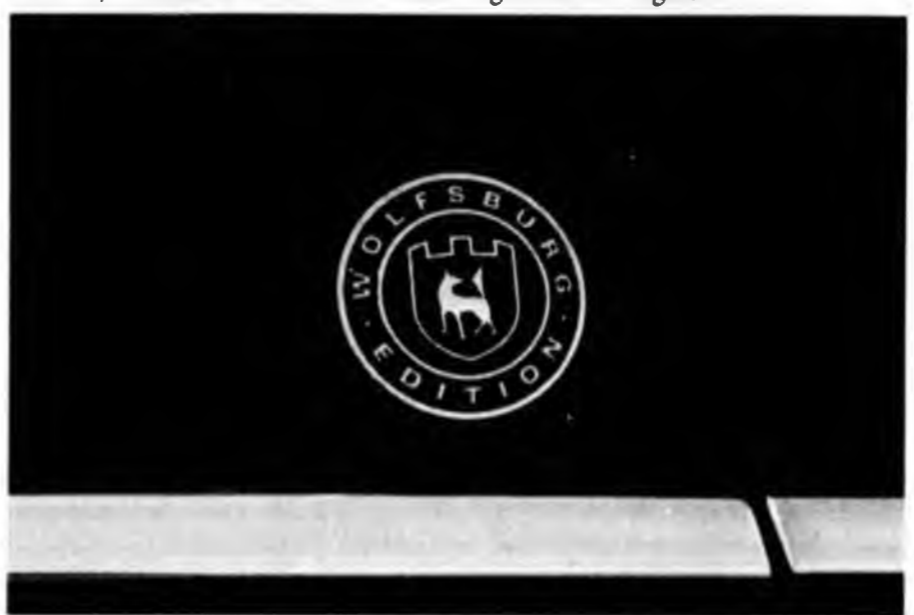
The Wolfsburg Edition adds a panoramic sunroof and more.