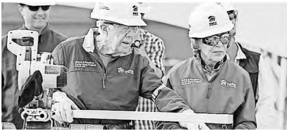
Former U.S. President Jimmy Carter and his wife Rosalynn volunteered to build houses in Canada with Habitat for Humanity.