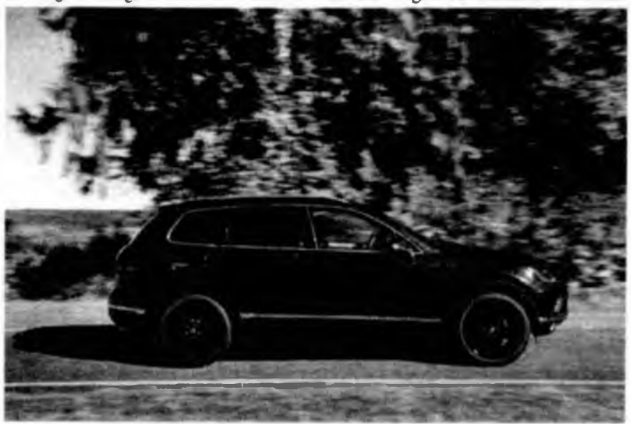
The 2017 Volkswagen Touareg is a great match for Michigan summers.

Second, however, is a negative about Touareg: It's only adequately powered. It comes with a 3.6-liter V6 engine that produces 280 horsepower and 265 pound-feet of torque, coupled with an eight-speed automatic transmission and all-wheel drive as standard. It accelerated to 60 mph in an unremarkable 7.7 seconds in testing by Edmunds. Yet its mileage is only 19mpg combined, only an average figure for this segment.