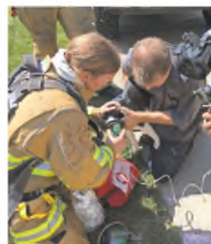
Firefighters rescued a cat from a house fire Monday morning from a home on Grantland. Crews used an oxygen mask designed for pets during the rescue. Fire officials say the cat appeared to be fine.

The family's two dogs were able to get out to a