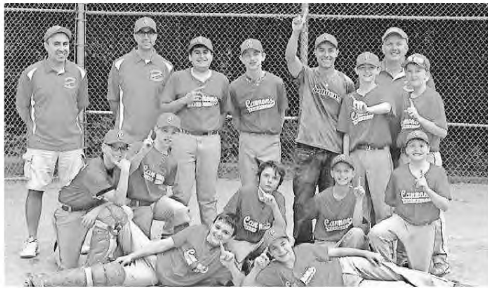
The 12-and-under Commerce Cannons recently completed a 17-0-1 season.