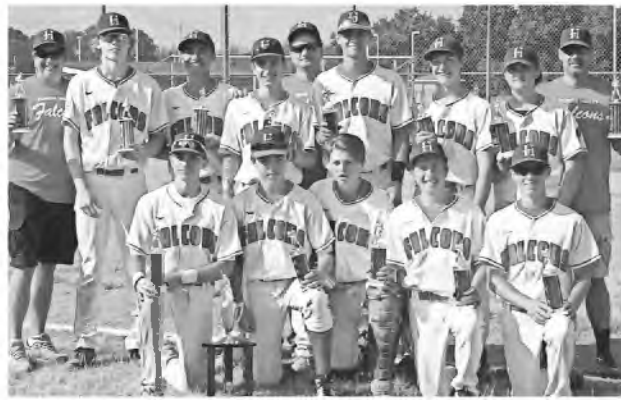
The Huron Valley Falcons 16-and-under baseball team captured the FFAST July Bash in Whitmore Lake.

The Thunder went back on top with two more in the top of the sixth, 9-8, but their lead didn't last long as the Falcons responded with