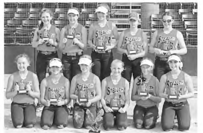
The South Lyon Stealth 12-and-under girls softball team finished runner-up in the NSA South Fastpitch World Series.